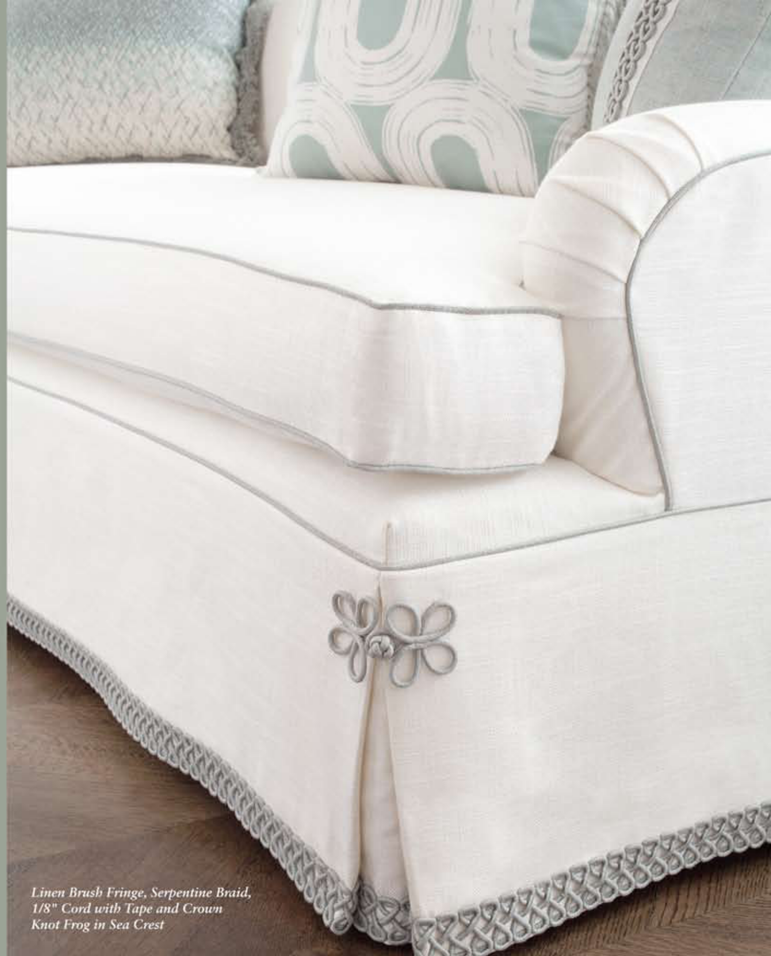
Linen Brush Fringe, Serpentine Braid, 1/8" Cord with Tape and Crown Knot Frog in Sea Crest

Get swept away by the unexpected subtle beauty of this sea-inspired, natural linen collection of passementerie. Samuel and Sons' Harbour collection introduces a selection of organic cords, braids and hand-knotted fringe reminiscent of nautical regalia. From the 3/8" Cord with Tape to the Serpentine Braid and Barrel Knot Fringe, this slightly rough-hewn collection focuses on the inherent nature and beauty of linen and its translation when woven. Of particular note is the Beaded Braid in which yarn-covered beads float across the waves of an intricate lanyard gimp. The hand-knotted Barrel Knot Fringe employs a wonderful rhythm in its alternating length twisted rope hangers and use of the nautical Barrel knot. A triple-ply rope holdback featuring beads and Barrel knots, a linen frog with a historic Crown knot in its center, and a 5" key tassel accented by a bead, complete the selection. The Harbour color palette lies within quieter hues of Sand Dune, Flax and Sea Crest, as well as nostalgic maritime colors such as Sail, Navy and Lobster. The poetic vision of the Harbour collection is realized in its linen fiber, nautical knotting techniques and oceanic color spectrum.