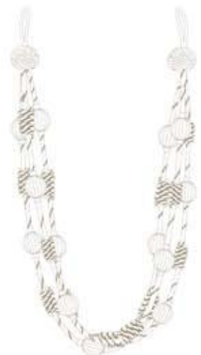
36" (91cm) Beaded & Knotted Holdback

Each style is available in Sail, Sand Dune, Flax, Sky, Sea Crest, Aqua, Kelp, Lobster and Navy