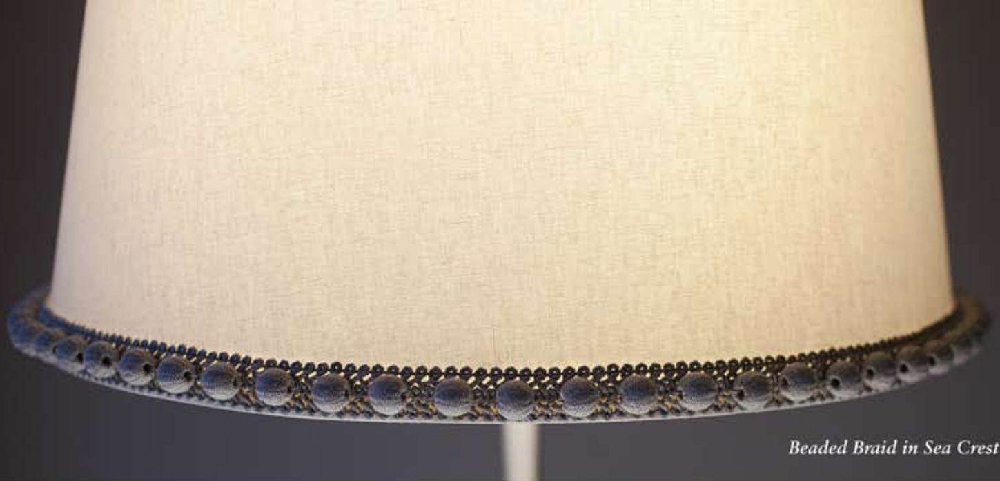
Beaded Braid in Sea Crest