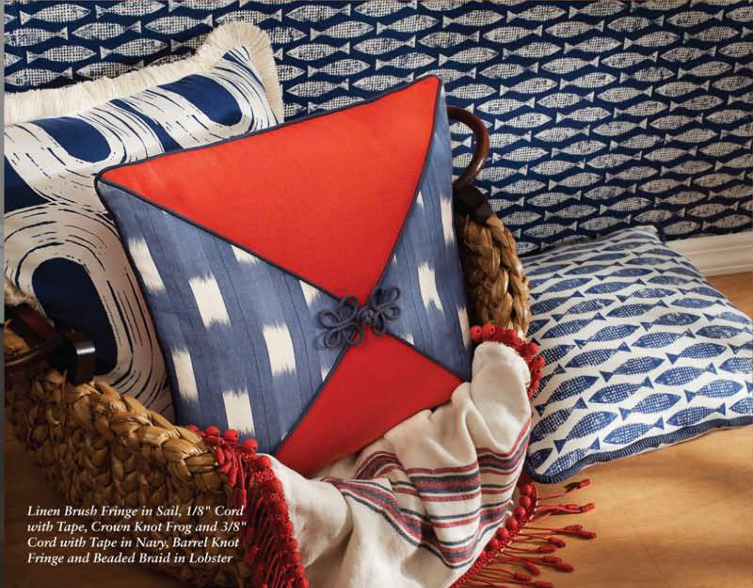
Linen Brush Fringe in Sail, 1/8" Cord with Tape, Crown Knot Frog and 3/8" Cord with Tape in Navy, Barrel Knot Fringe and Beaded Braid in Lobster