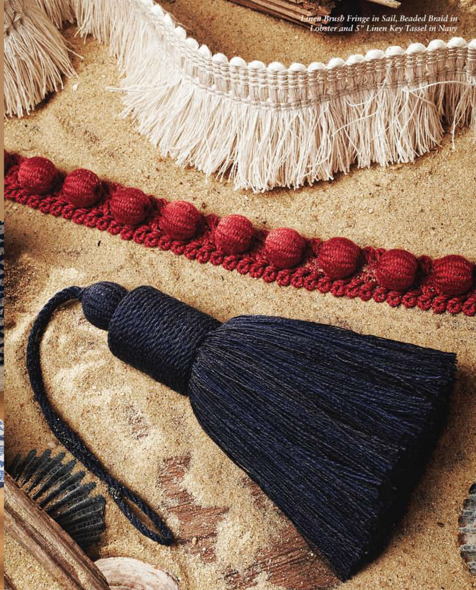
Linen Brush Fringe in Sail, Beaded Braid in Lobster and 5" Linen Key Tassel in Navy