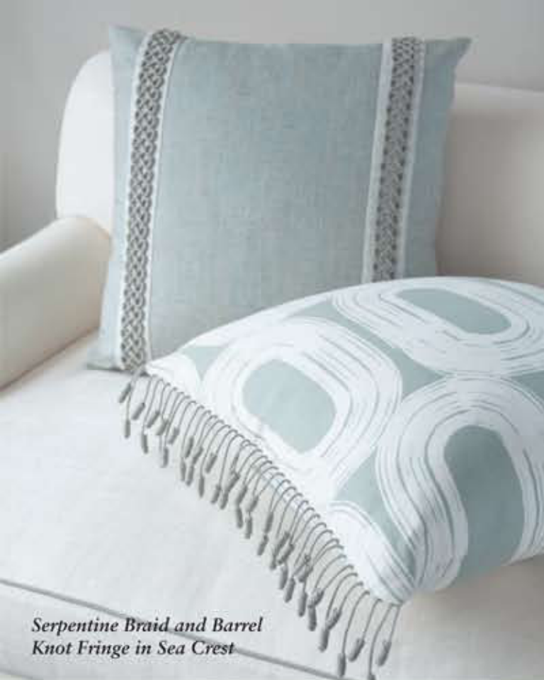
Serpentine Braid and Barrel Knot Fringe in Sea Crest