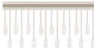
4.3" (11cm) Barrel Knot Fringe