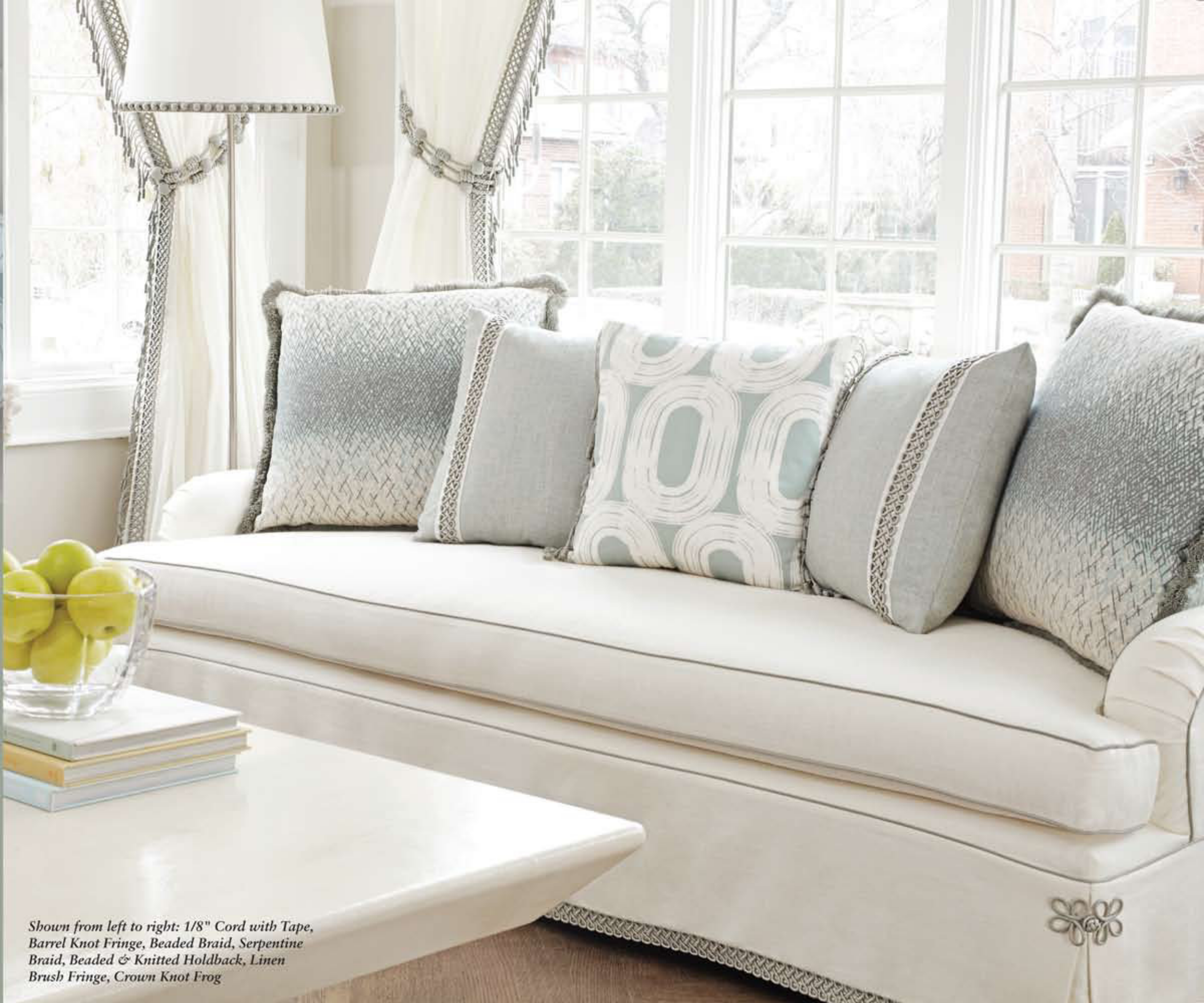
Shown from left to right: 1/8" Cord with Tape, Barrel Knot Fringe, Beaded Braid, Serpentine Braid, Beaded & Knitted Holdback, Linen Brush Fringe, Crown Knot Frog

"This slightly rough-hewn collection focuses on the inherent nature and beauty of linen and its translation when woven. The hand-knotted Barrel Knot Fringe employs a wonderful rhythm in its alternating length twisted rope hangers and use of the nautical Barrel knot."